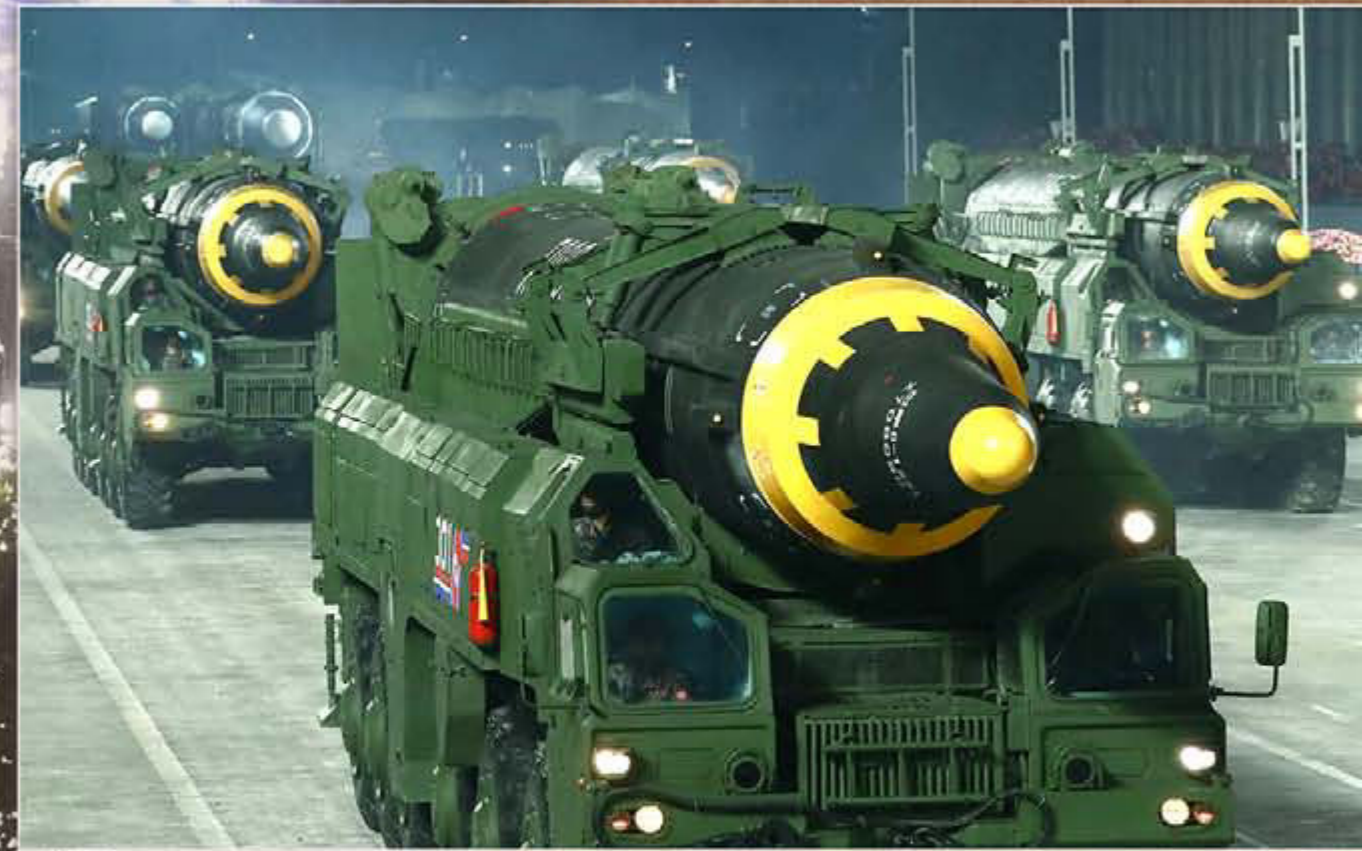
Columns of ICBMs demonstrate the dignity and strength of the DPRK