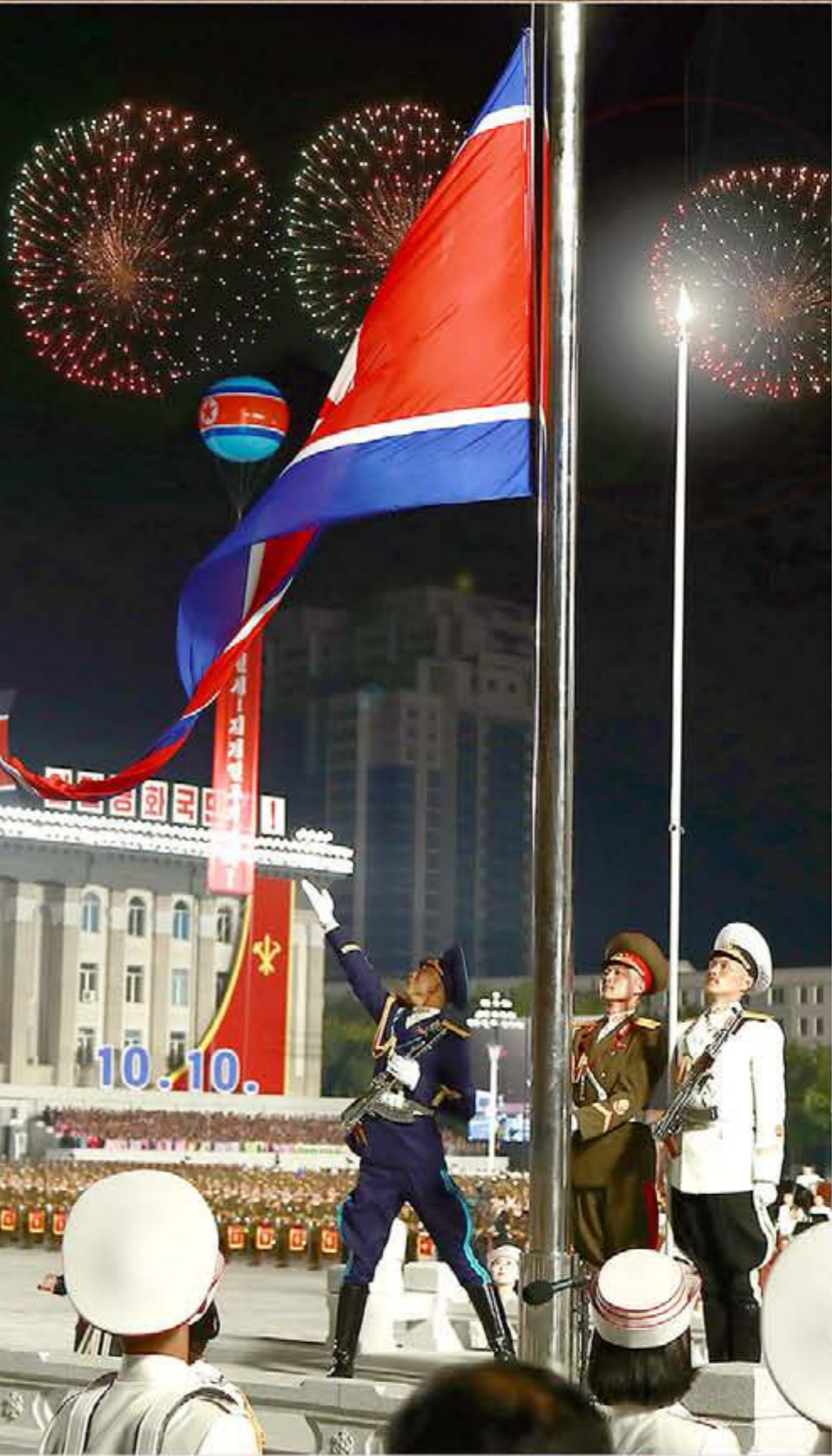
The national flag was hoisted amid the playing of The Patriotic Song