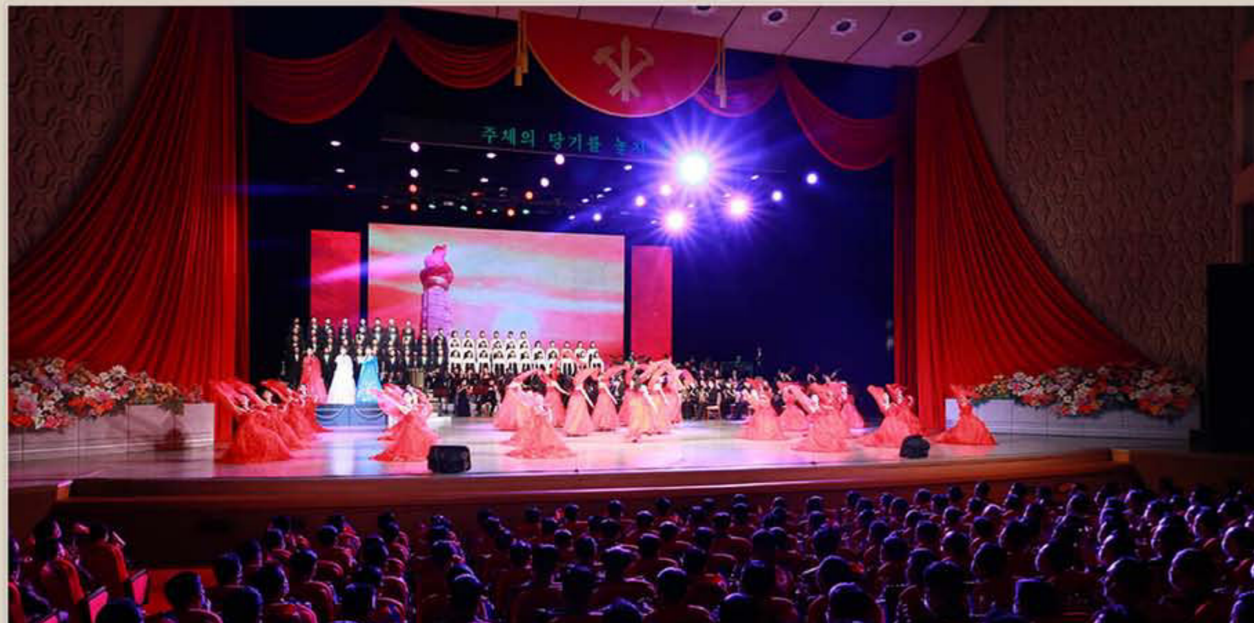
Joint performance of the Mansudae and Wangjaesan art troupes and concert of the National Symphony Orchestra