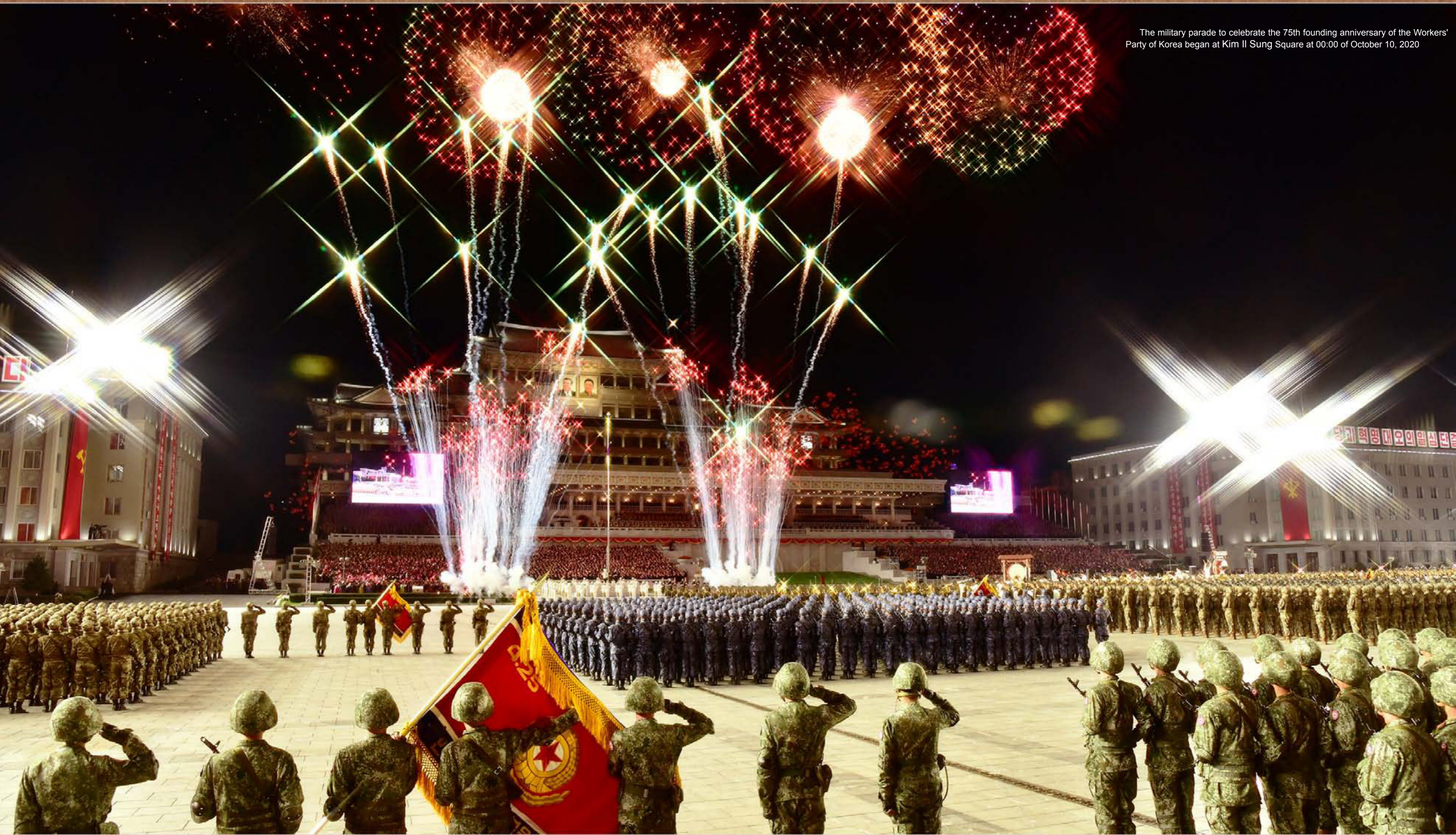
The military parade to celebrate the 75th founding anniversary of the Workers' Party of Korea began at Kim Il Sung Square at 00:00 of October 10, 2020