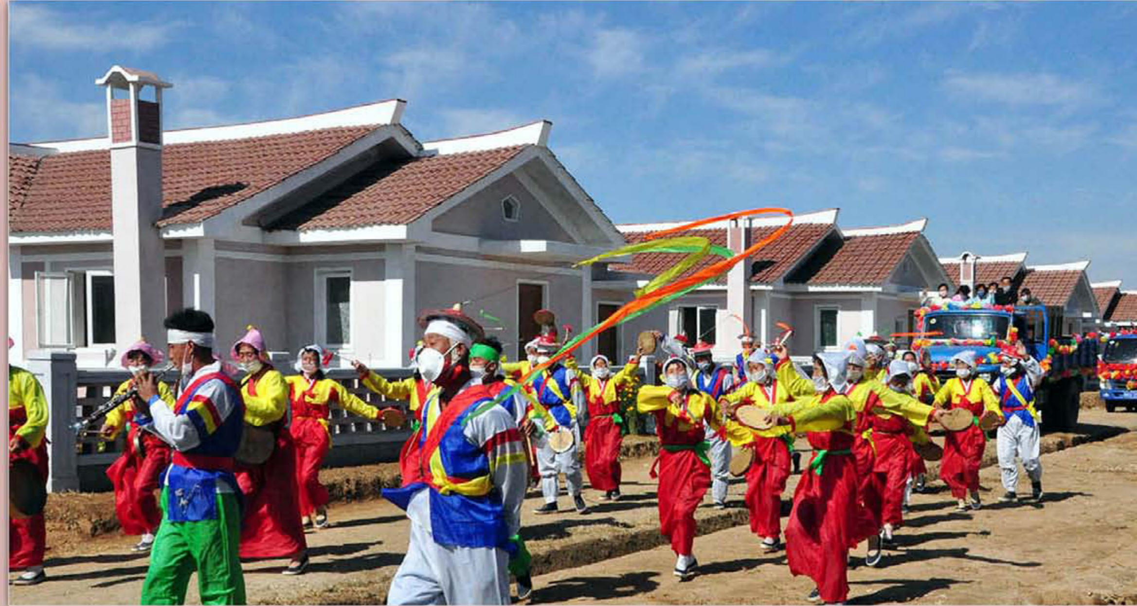
Flood victims moved to new houses on the eve of the October holiday