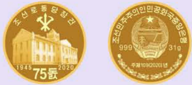
Commemorative coin "75th Founding Anniversary of the Workers' Party of Korea" (gold coin)