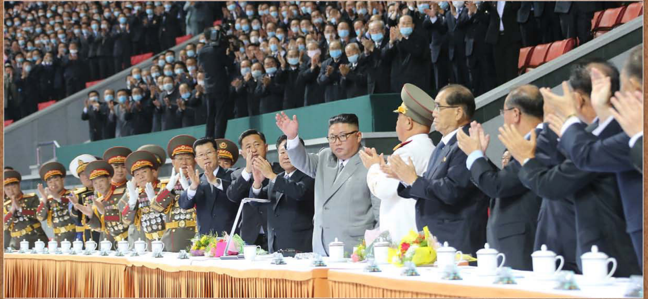
Supreme Leader Kim Jong Un waved back to the performers of the grand gala and the audience in October 2020