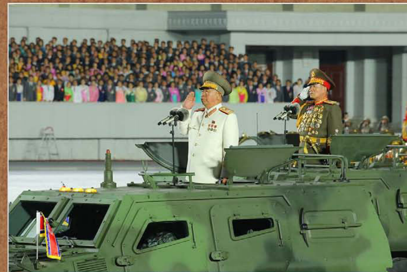
KPA Marshal Ri Pyong Chol, vice-chairman of the Central Military Commission of the WPK, reported to the Chairman of the WPK that the military parade was ready to start

On the order of Marshal Pak Jong Chon, chief of the