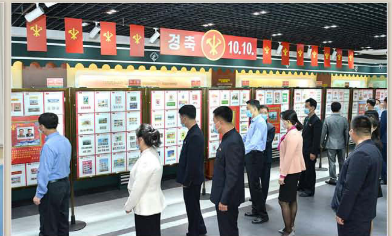
National exhibitions of books, industrial art designs and Korean stamps