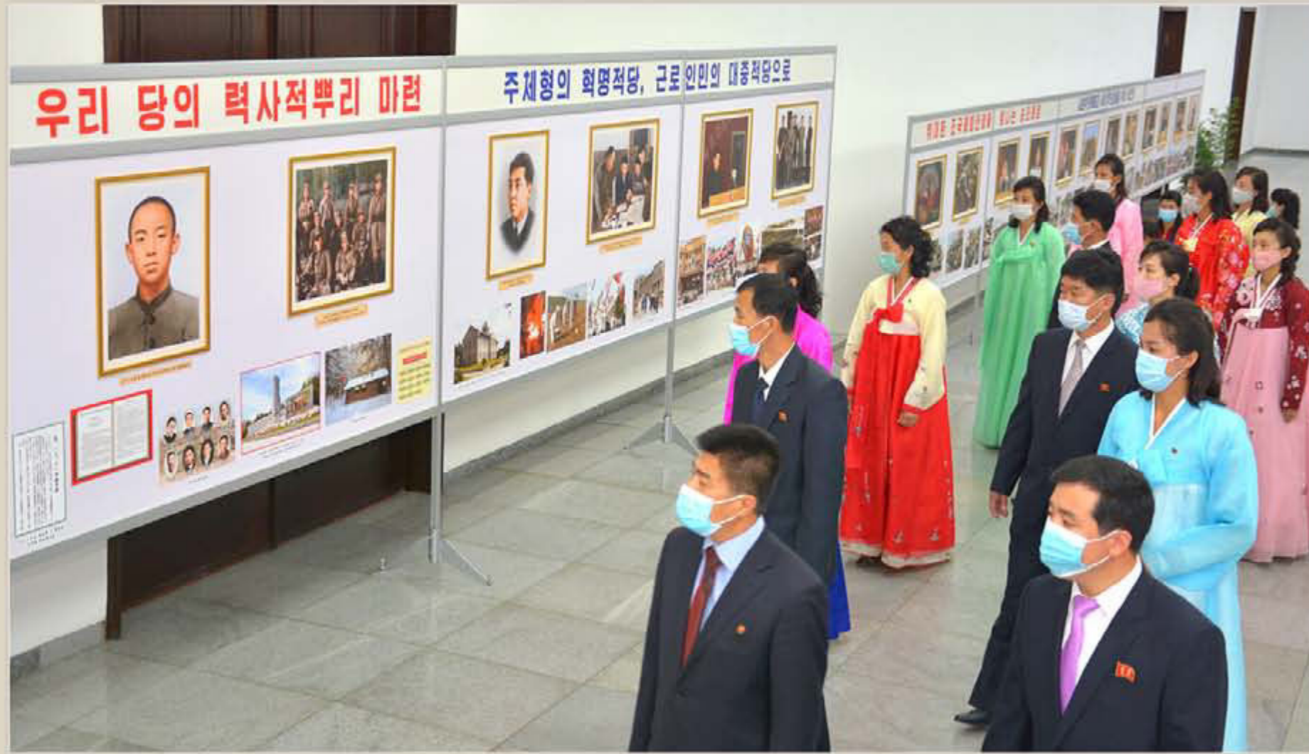
National photo exhibition