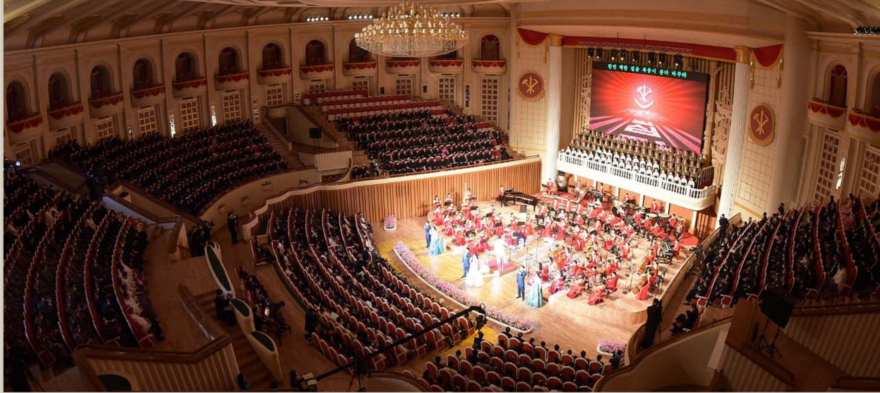
Performance of the Samjiyon Orchestra