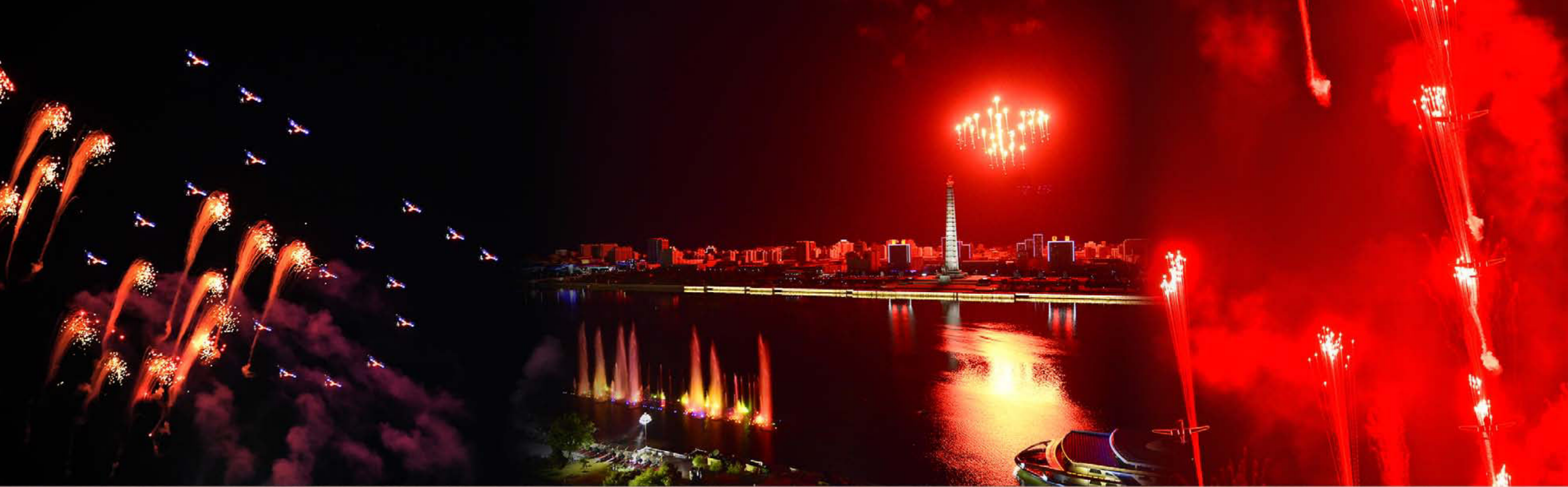
There was a flight in the sky above Kim Il Sung Square, demonstrating the invincible might of the Juche-oriented air force