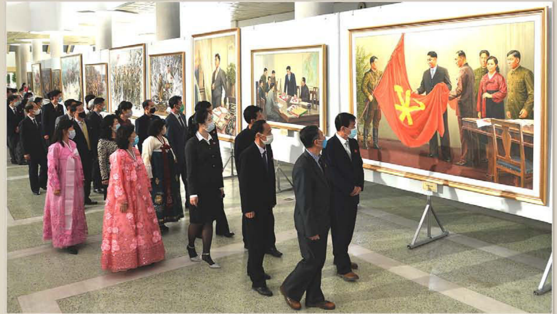
National art exhibition

All the Korean people celebrated the 75th birthday of the Workers' Party of Korea significantly.