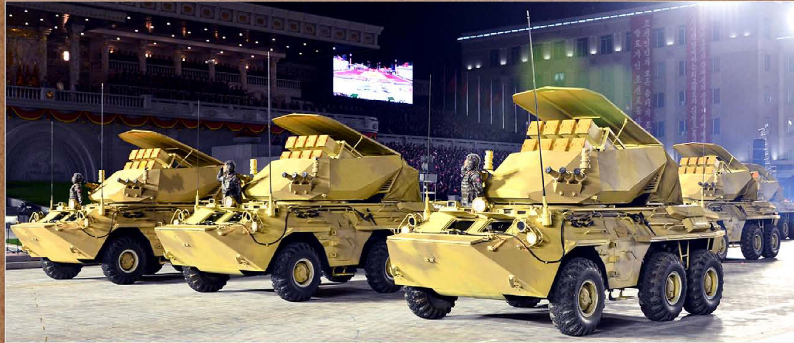
Columns of mechanized units began their procession led by the column of armoured vehicles

of pride of the armed forces of the DPRK.