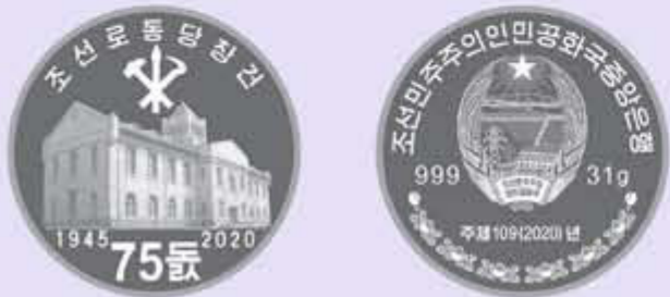
Commemorative coin "75th Founding Anniversary of the Workers' Party of Korea" (silver coin)